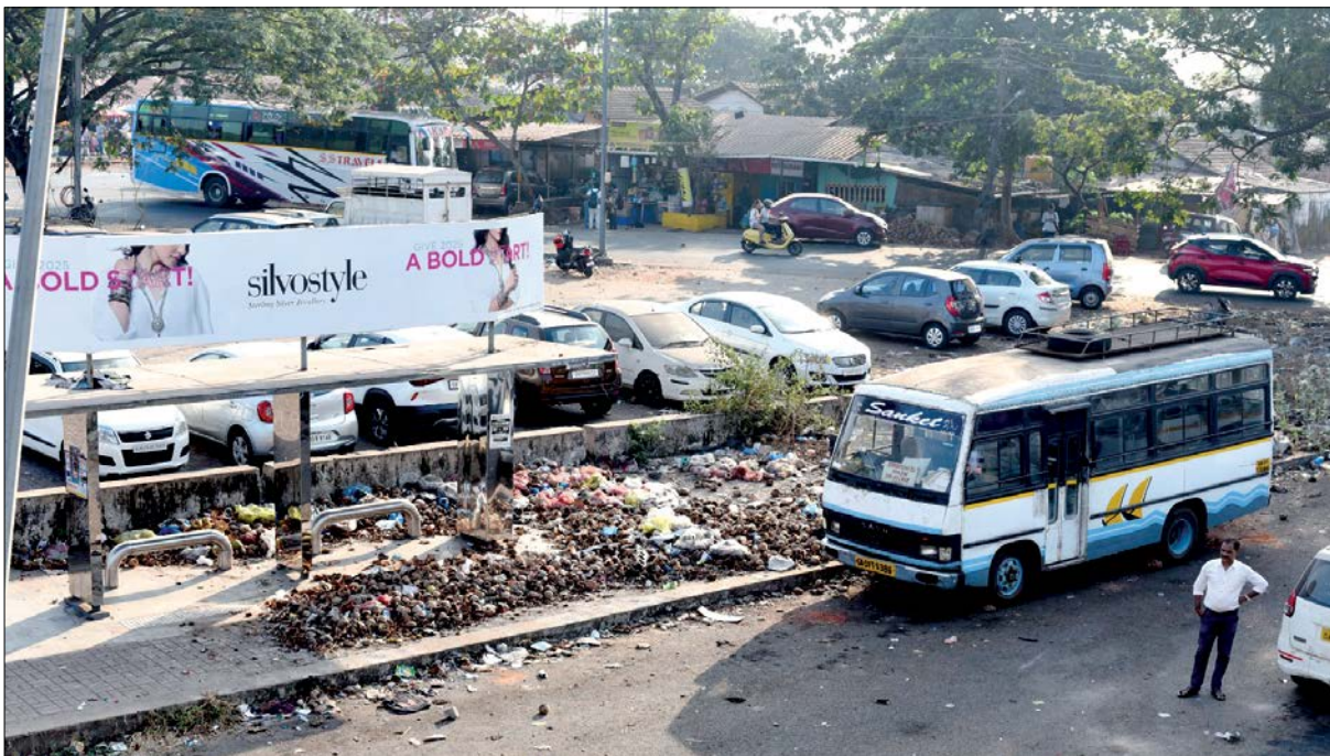
Tender coconut vendors around Goa Medical College, Bambolim, have started using the newly constructed, unused bus stand as a dumping ground for their garbage and coconut shells, creating an eyesore outside the State's premier public hospital