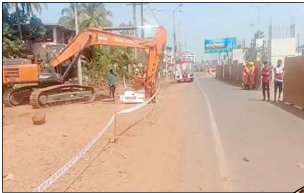
Just two days prior, officials from the fuel company had sought police intervention to stop the excavation work near the pipeline while pumping was underway

A major tragedy was averted as the damaged pipeline, belonging to Zuari Indian Oil Adani Ventures Private Limited (ZIAVPL), formerly known as Zuari Indian Oil Tanking Private Limited, was not in operation at the time of the incident. However, the escape of trapped air from the empty pipeline led to panic, with people in the vicinity mistakenly believing it to be a