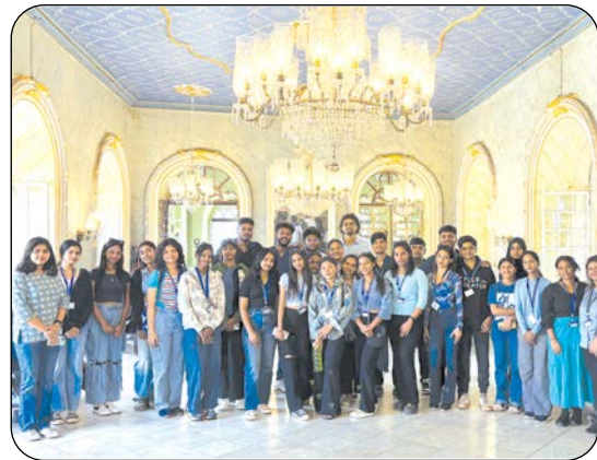
REDISCOVERING TREASURES OF PAST GOA