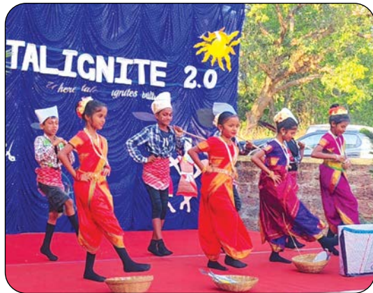
STUDENTS OF ST THEREZA'S CONVENT HS, RAIA SHOW THEIR TALENT AT TALIGNITE 2.0