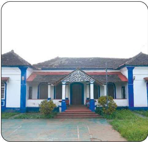
A CLOSER LOOK AT MOIRA