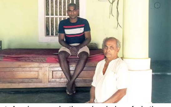
Late Amar's younger brother and uncle, hope for justice

"All the states/UTs must issue a standing order to their respective police machinery to issue notices under Section 41-A of CrPC, 1973/Section 35 of BNSS, 2023 only through the mode of service as prescribed under the CrPC, 1973/BNSS, 2023," the bench said on January 21. The top court went on, "It is made amply clear that service of notice through WhatsApp or other electronic modes cannot be considered or recognised as an alternative or substitute to the mode of service recognised and prescribed under the CrPC, 1973/ BNSS, 2023."