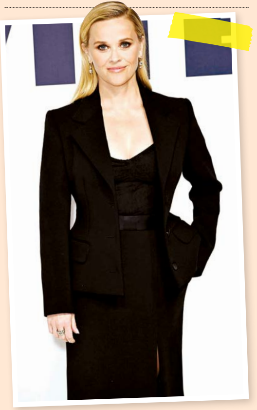
Reese Witherspoon puts sultry spin on the skirt suit at 'You're Cordially Invited' London premiere