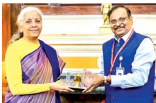
Union Finance Minister Nirmala Sitharaman during a meeting with ISRO Chairman V Narayanan, in New Delhi