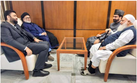
A delegation led by Mirwaiz Umar Farooq, the religious head of Kashmir, at Parliament Annexe, in New Delhi, on Friday

more time to allow them to frame their views after studying the views of stakeholders.