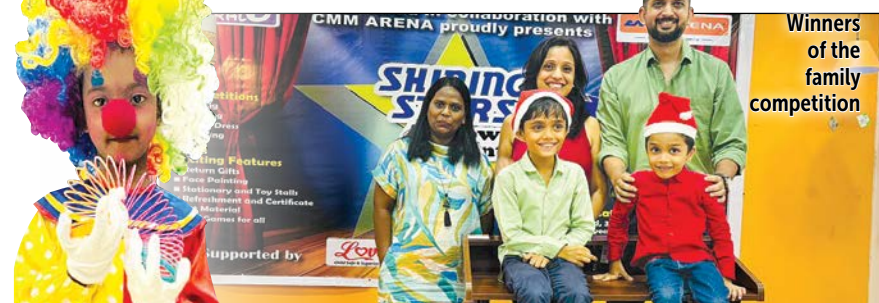
Winners of the family competition