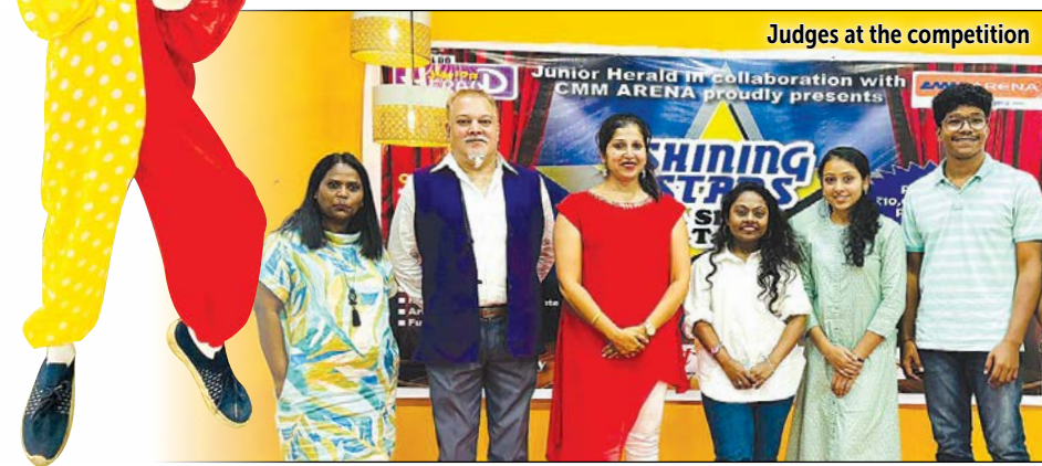
Judges at the competition

Junior Herald, in collaboration with CMM Arena, organized a day-long talent extravaganza titled Shining Stars. The event celebrated young talent across multiple categories and brought families together for an unforgettable experience. The event featured two participant groups: Group 1: Ages 5-8 years Group 2: Ages 9-12 years. Winners in both categories were awarded first, second, and third prizes, while all participants received gifts courtesy of CMM Arena. The event also showcased six family performances, with the top three receiving special awards.