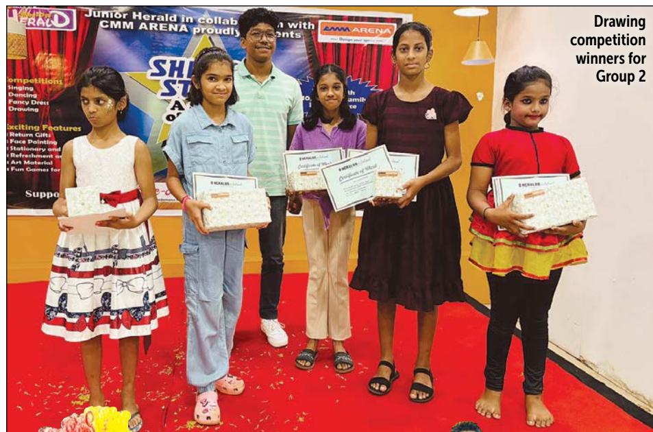
Drawing competition winners for Group 2