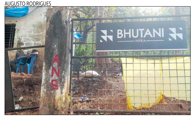
(L) Security guard has a snooze as locals seethe with disgust

We are only testing soil, says company; watchful locals warn of collective fight ahead