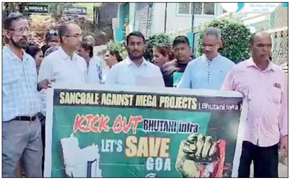
Sancoale locals protest against the Bhutani project

protection based on the High Court direction of December 18, 2024. We brought in machinery to do soil testing to get environment clearance and not to construct," assured Taneja.