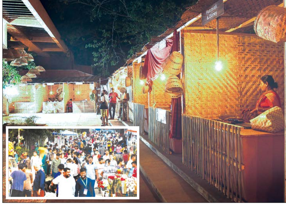
Despite the crowds at Lokotsav in Campal-Panjim, the Goan tribal artisans tucked away inside Kala Academy are struggling to attract visitors, dampening their spirits and sales