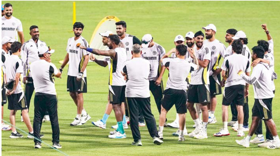
Team India during a training session on the eve of the first T20 match of the series against England, at Eden Gardens in Kolkata, on Tuesday

With pace spearhead Jasprit Bumrah nursing a back injury and his Champions Trophy participation