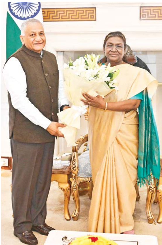
President Droupadi Murmu with Mizoram Governor General V K Singh (Retd.) during a meeting, in New Delhi