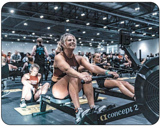
CONQUERING THE ULTIMATE FITNESS CHALLENGE INSIDE THE WORLD OF HYROX