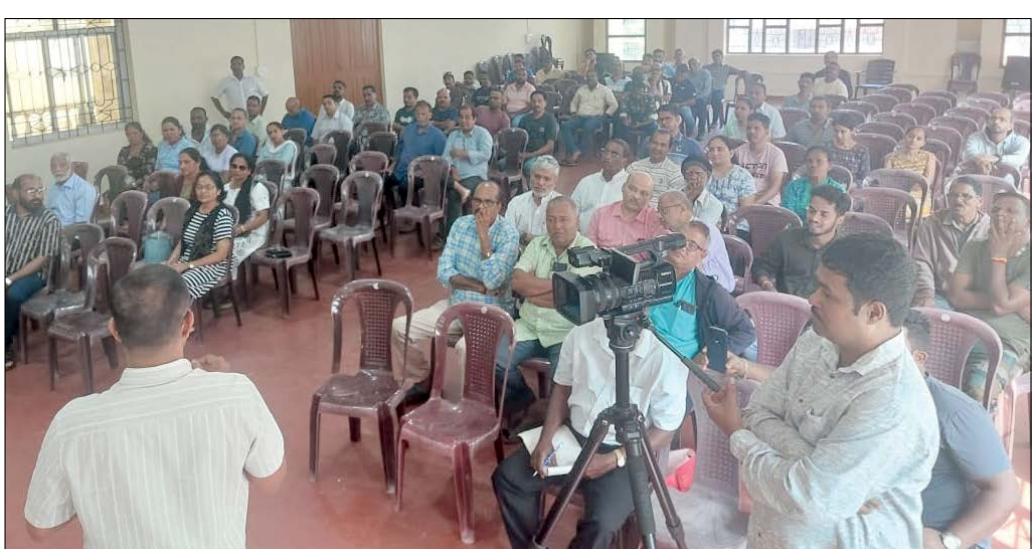
UNITED THEY OPPOSE: Loliem-Polem Villagers stand their ground against the film city project

The meeting brought to light concerns about the potential ecological and social damage posed by the project. Locals fear the proposed development