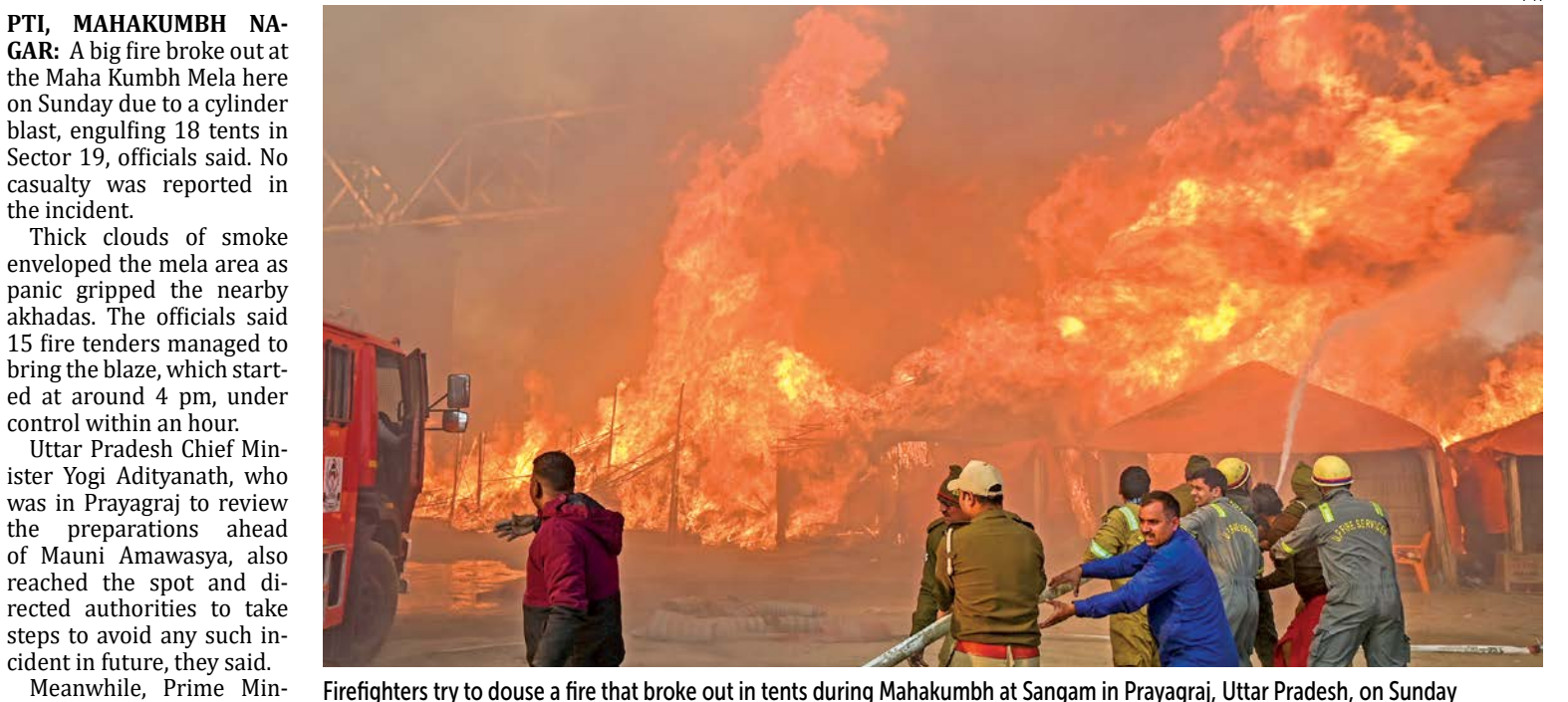
Firefighters try to douse a fire that broke out in tents during Mahakumbh at Sangam in Prayagraj, Uttar Pradesh, on Sunday

Fire engulfs 18 tents in Sector 19; 15 fire tenders managed to bring the inferno under control