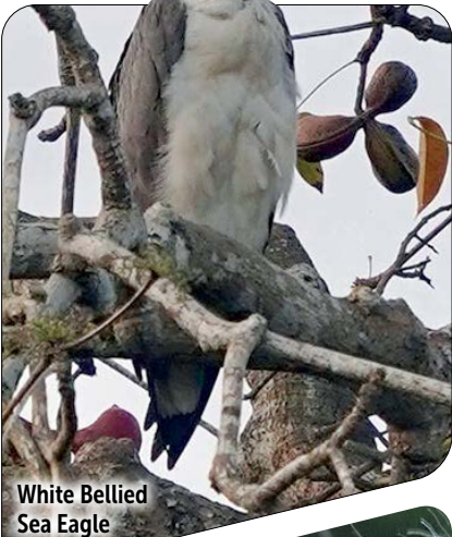
White Bellied Sea Eagle