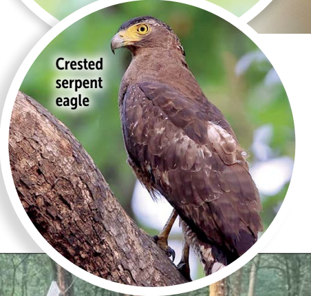
Crested serpent eagle