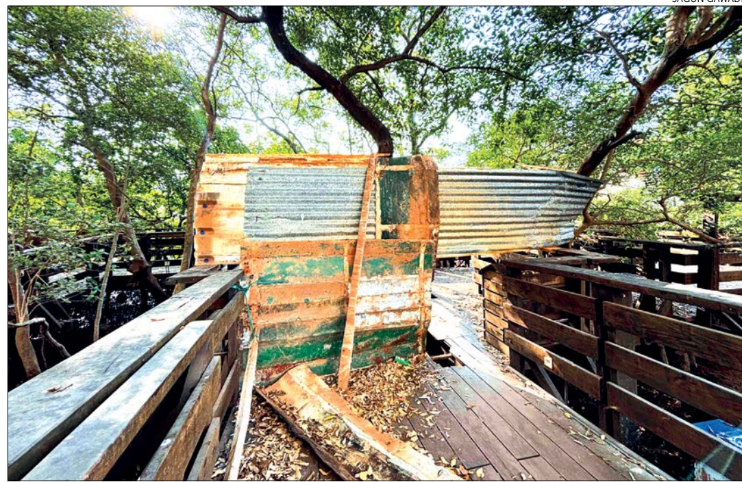
The wooden walkway, now in a dilapidated state, is in urgent need of attention from the authorities behind the Central Library at Sanskruti Bhavan, Panjim.