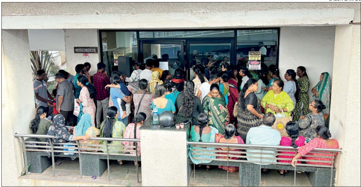
Public thronged the Art And Culture Department at Sanskruti Bhavan, Patto to collect coupons for setting up stalls for the upcoming Lokotsav 2025 to be held at Darya Sangam, Kala Academy. The coupons are allotted based on a lottery system