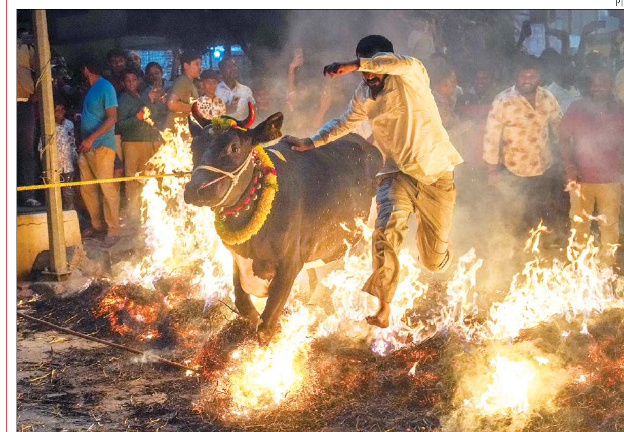
A man leads a cow to jump across a burning haystack during an annual ritual to exorcise evils on the Makar Sankranti festival in Bengaluru, on Tuesday