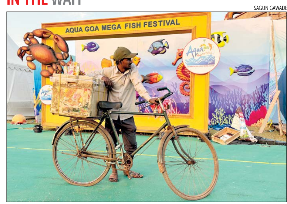
An ice-cream vendor eagerly waits for customers on the eve of the Aqua Goa Mega Fish Festival 2025. The festival commences today, January 10 and will conclude on January 12