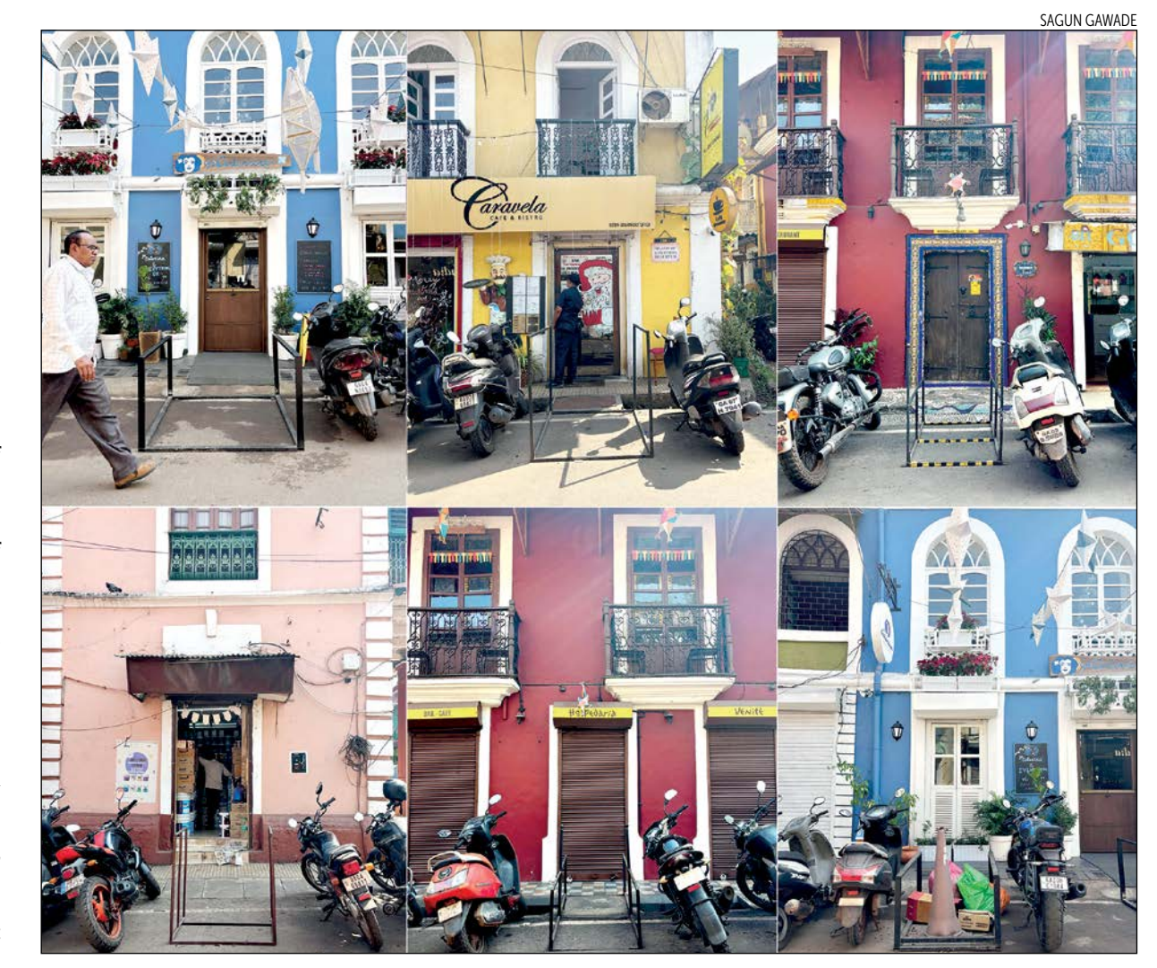
Illegal barricades installed by restaurants and business establishments along the 31st January road, two-third area of the route is already occupied with vehicles the casino staff and the rent-a-bikes by tourists

We have not given any permission to the restaurants or shops to install barricades in front of their entrance. However, some have installed them. We will take action against them and ensure that these barricades are removed,"