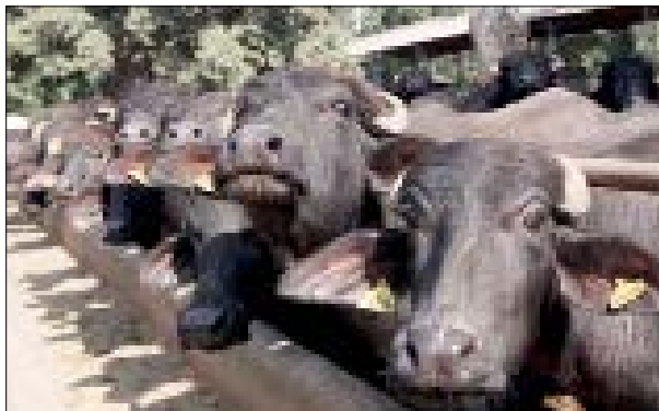
Indian buffalo meat is "cost competitive with other red meats" and is perceived as being more natural

The shortage, which has resurfaced in the state, has disrupted beef supply, forcing several meat stalls to shut down due to a lack of stock. At the Goa Meat Complex, no animals were brought in for slaughtering over the last two days, further compounding