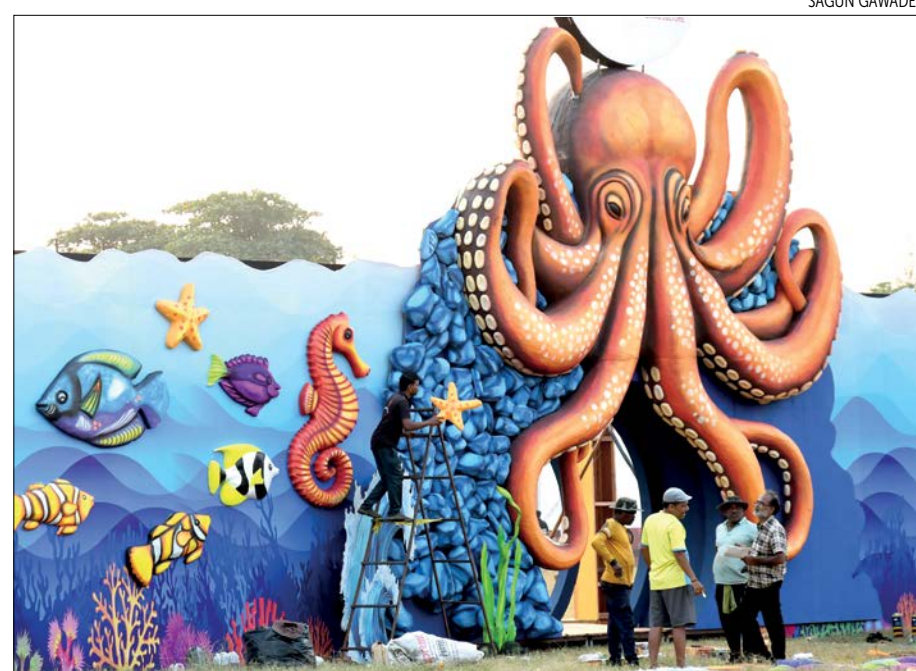
A décor depicting octopus has been put at the entrance for the upcoming Aqua Goa Mega Fish Festival at Campal ground, Panjim. The event will be held from January 10 to 12