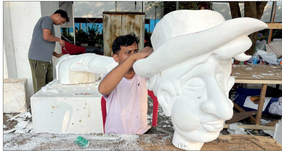
An artist gives shape to a sculpture made from thermocol for the upcoming the Lokotsav 2025 which will be held from January 17 to 26 at Darya Sangam, an exhibition ground at Kala Academy, Campal Panjim