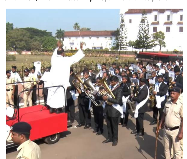
A brass band with over 100 musicians, enhanced the solemnity on the concluding day of the Exposition