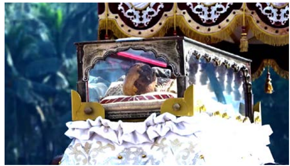
A close view of the relics of St Francis Xavier being taken out in a procession from the Sé Cathedral to the Basilica of Bom Jesus at Old Goa