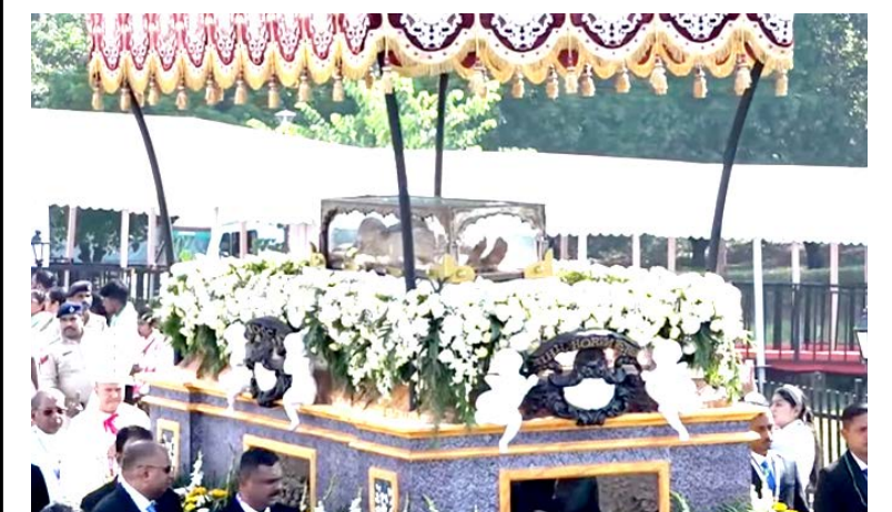
The carriage with the relics of St Francis Xavier taken out in a procession from the Sé Cathedral to the Basilica of Bom Jesus at Old Goa