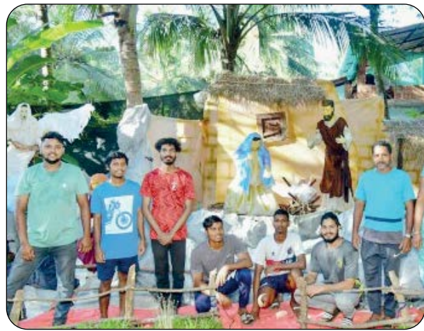
THE BEST CHRISTMAS CRIBS IN GOA