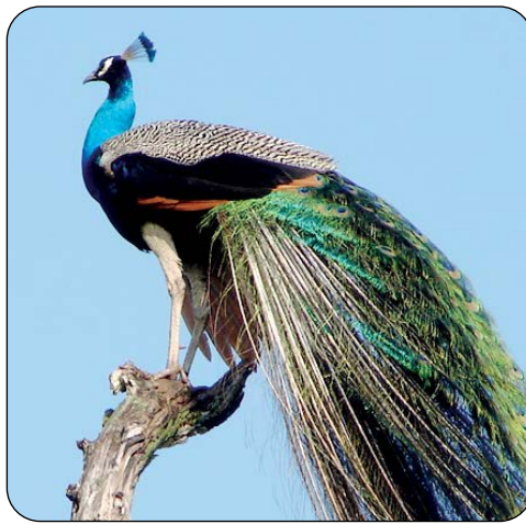
THE POLITICS OF PEACOCKS