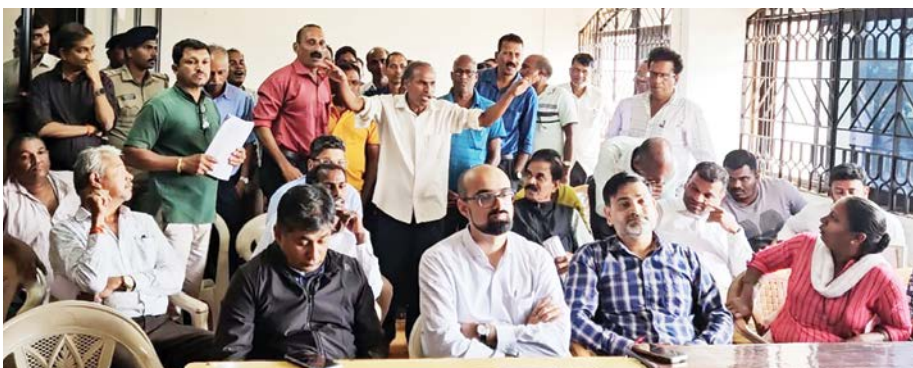
The Friday meeting at Pilgao with all stakeholders

This followed a second consecutive night of protests on Thursday, where locals blocked the trucks transporting ore, alleging that the noise pollution was ruining their sleep and throwing the lives of their