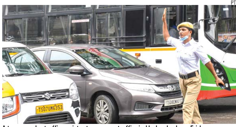
A transgender traffic assistant manages traffic, in Hyderabad, on Friday

“My parents did not accept me. But, they accepted me now. My friends used to avoid me. But, now they message me and keep in touch. After I got the job, my relations and others are appreciating. It is a wonder. I cannot describe in words