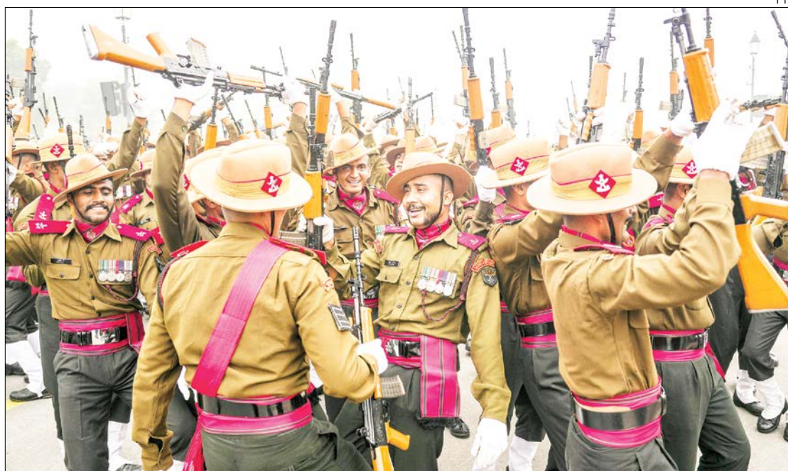
Assam Rifles personnel during rehearsal for the Republic Day Parade 2025, amid fog, at Kartavya Path in New Delhi, on Friday. Around 400 flights were delayed in the national Capital due to poor visibility during the day