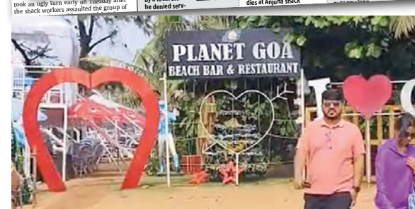
Beach shack where the altercation happened

Argument over serving food turns ugly between shack staff and holidaymakers from Andhra Pradesh