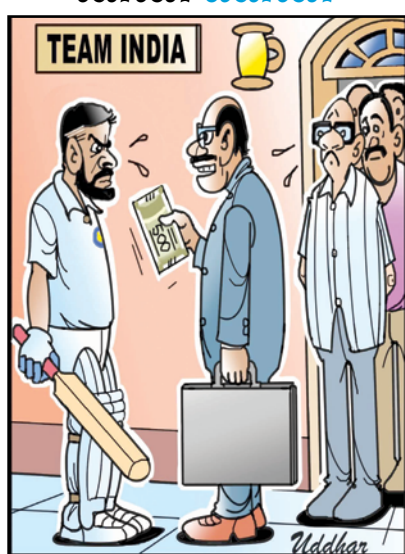
Your match fees after deducting all the fines, penalties & taxes!