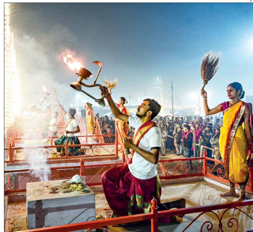
'Mahila Batuk' along with priests perform Ganga Arti on the first day of the New Year, at Sangam in Prayagraj, Uttar Pradesh, Wednesday