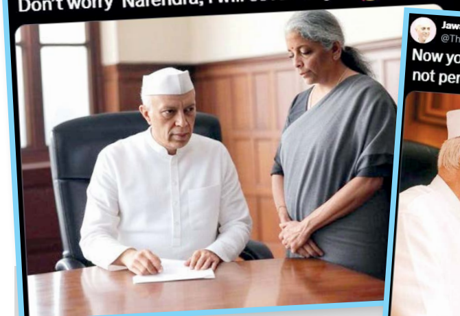
Two of the posts on X from the @The_Nehru handle that have drawn hundreds of reactions

Today I ordered Nirmala to impose GST on popcorn. Don't worry Narendra, I will cover for you