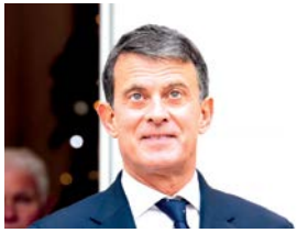
Newly named Minister for Overseas Affairs Emmanuel Valls looks on after the hand over ceremony, in Paris, on Tuesday