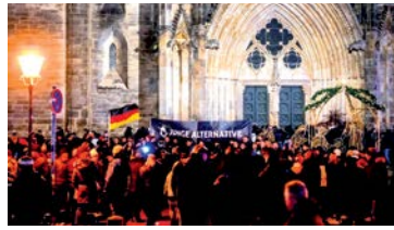
People attend an AfD election campaign in front of the cathedral in Magdeburg, Germany