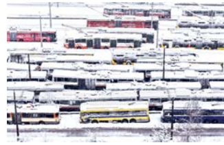
An aerial view of parked trolley buses during heavy snowfall in Sarajevo, Bosnia, on Tuesday