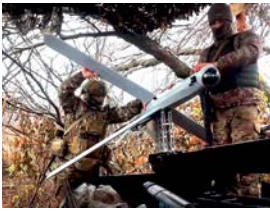
Russian soldiers prepare a Lancet unmanned aerial vehicle to launch it towards Ukrainian positions on an undisclosed location in Ukraine, on Tuesday