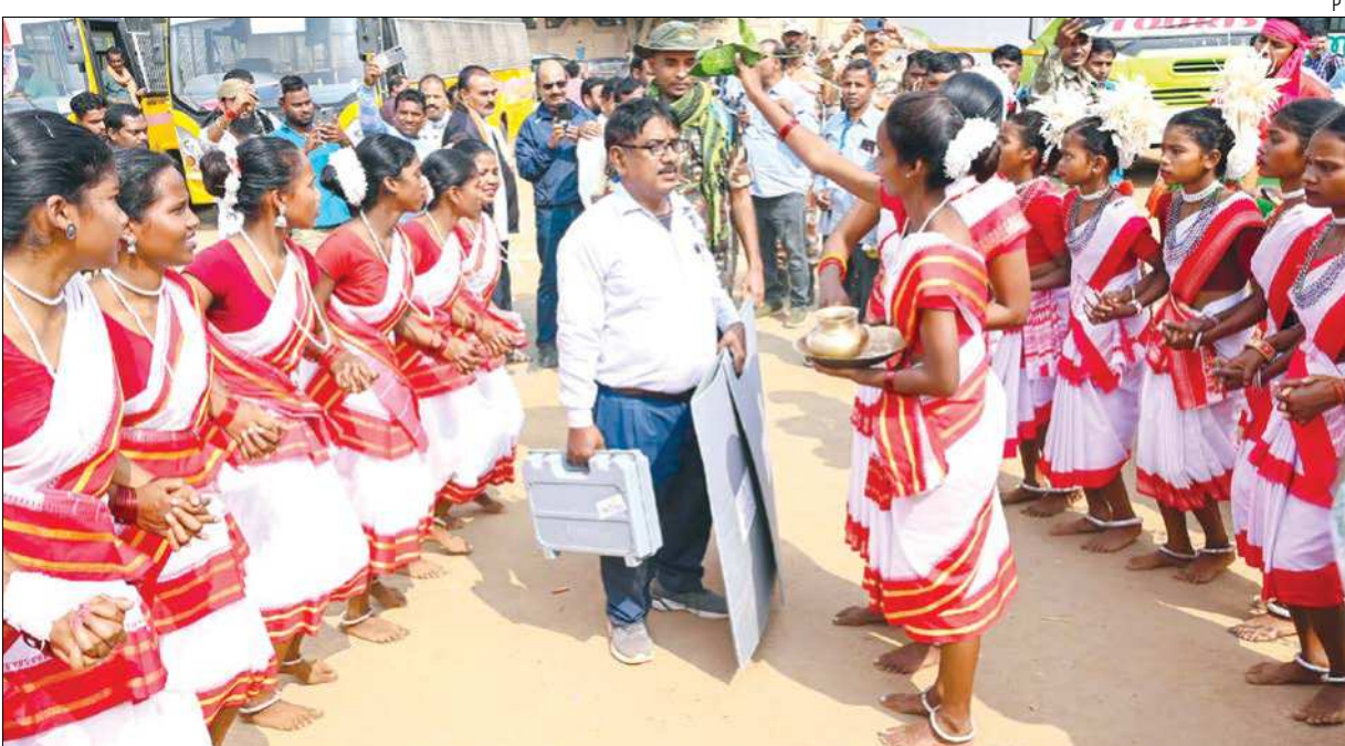
Women from the tribal community give a traditional welcome to an election official before he leaves for his allotted polling station on the eve of the first phase of Jharkhand Assembly elections, in Ranchi, on Tuesday