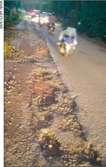
One of the potholed roads in Ponda town, posing a risk to motorists as they navigate the pathetic conditions by driving on the wrong side of the two-way road

It is worth noting that the government had previously hot-mixed some roads in the taluka, including those in Ponda town. However, this work was carried out during the monsoon season, resulting in the tar being