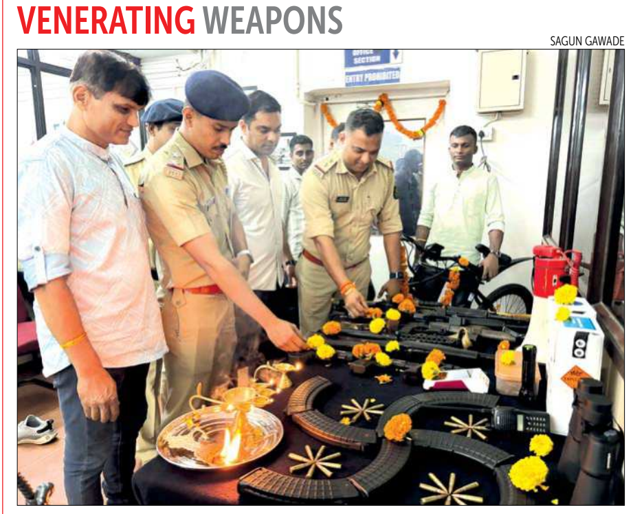
Police personnel performed the 'Shastra Puja' (worship of weapons) at the Panjim town police station on the occasion of Dussehra on Saturday