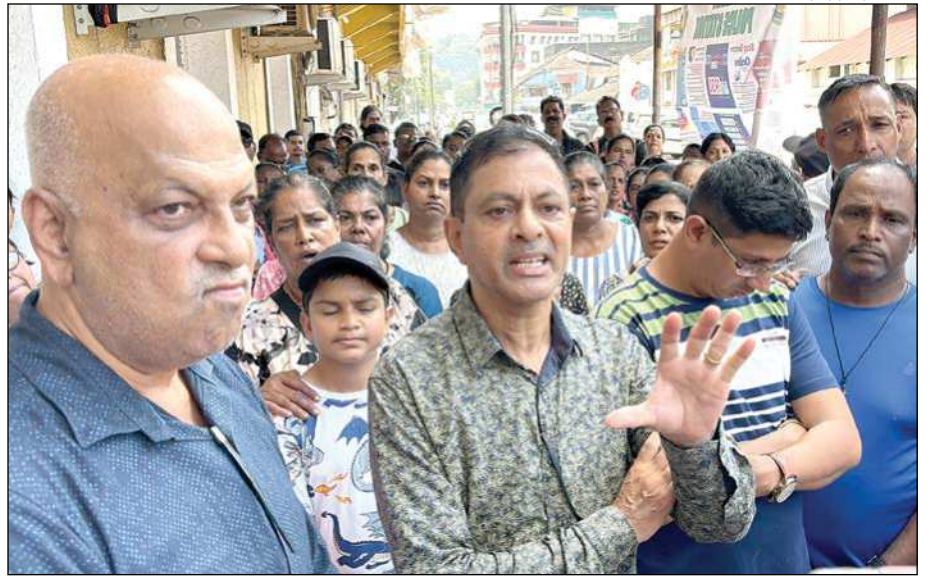
ARREST VELINGKAR NOW: The fire of protest fuelled by Subhas Velingkar's comments spread to Panjim, Taleigao and Caranzalem. People wanted no compromise in taking Velingkar to task.

the streets and burnt the effigy of Velingkar outside the police station.