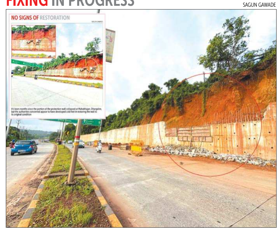
Taking cognisance of a photo appearing in O Heraldo , the authorities finally swung into action and commenced the repair works of the protection wall, which collapsed at Mahakhajan, Dhargalim. O Heraldo had highlighted the issue in its edition dated August 30