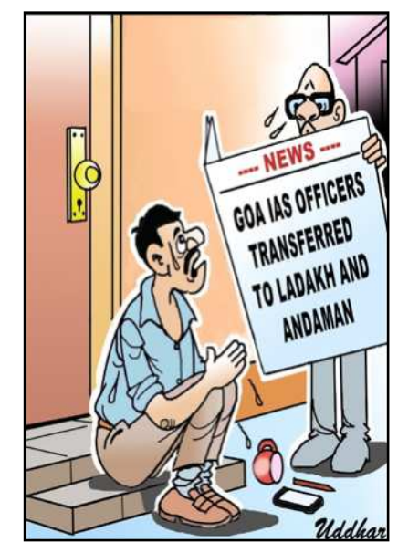
Ridiculous! How will I survive here without Goan fish curry?