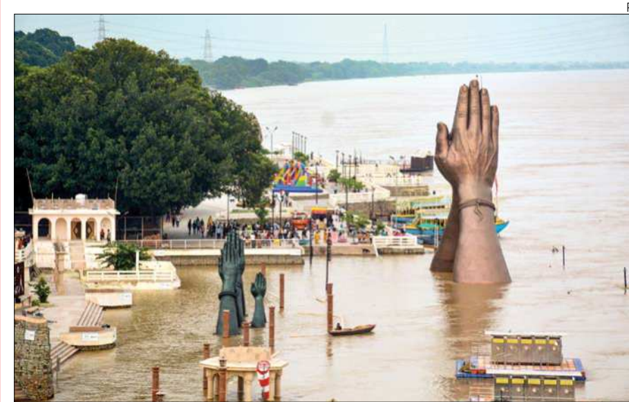
A 'ghat' submerged due to the sudden surge of water in the River Ganga, in temple town of Varanasi, in Uttar Pradesh, on Saturday