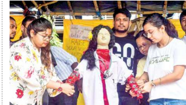
Doctors tie 'rakhis' to a symbolic statue of the R G Kar Medical College and Hospital incident victim during a protest, in Kolkata, on Monday. (Related reports on Pg 10 >>)

Senior doctors march to Kolkata Police HQ after notice over social media posts Medics threaten to intensify stir if attempts were made to stifle the 'demands seeking justice'