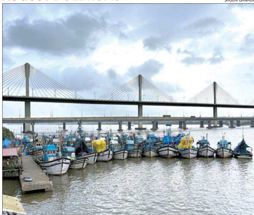
The trawlers are ready to begin with the new fishing season. However, bad weather and the unavailability of crew has dampened the spirit of the trawler owners