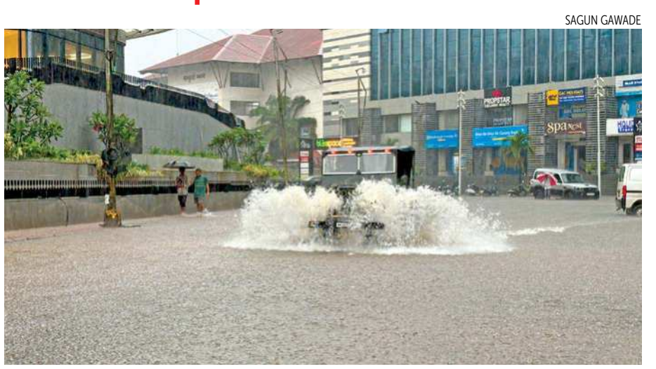
A vehicle creates a splash along the road leading to the Central Library at Patto, Paniim, which experienced flooding following heavy rains

A major landslide was reported at Conem-Priol on the Ponda-Panjim highway thereby blocking traffic movement in both directions. The traffic was