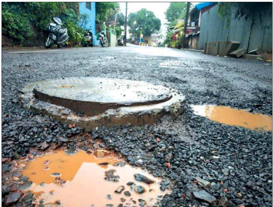
A sewerage manhole lies exposed in the middle of the road at Ribandar, which causes a risk to motorists especially two-wheeler riders