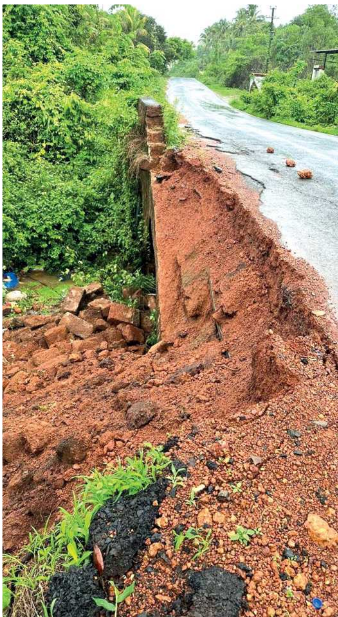
Culvert partially damaged at Gavona-Chorao

The IMD had recorded rainfall in Panjim at 3.3 inches followed by Old Goa at 2.7 inches