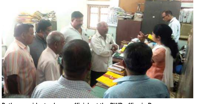
Bethora residents gherao officials at the PWD office in Daag, Ponda, on Monday

The locals complained that they are facing a water crisis as their taps have run dry for the past fortnight, with no water available to meet their daily needs. They further threatened to launch a gagar (empty utensils) morcha to the office on Tuesday, if the water supply was not restored by Monday.