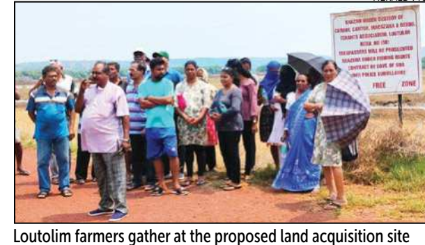
for the new Borim Bridge project, on Monday

The locals, along with Village Panchayat of Lotoulim, were frustrated over PWD's approach of first informing in writing regarding the land demarcation process and then changing the programme abruptly, without a detailed schedule, contact