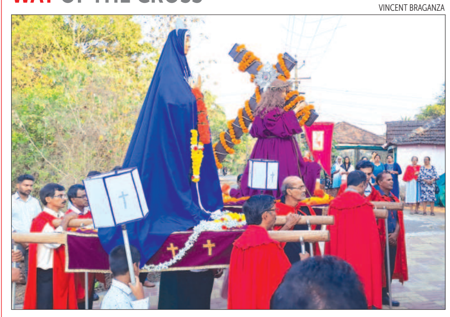
HOLY STEPS: Confrarias of Santo Cristo Church walk in a procession with the statues of Jesus carrying the cross, followed by Mother Mary, at Vanxim Island, near Divar, on Sunday